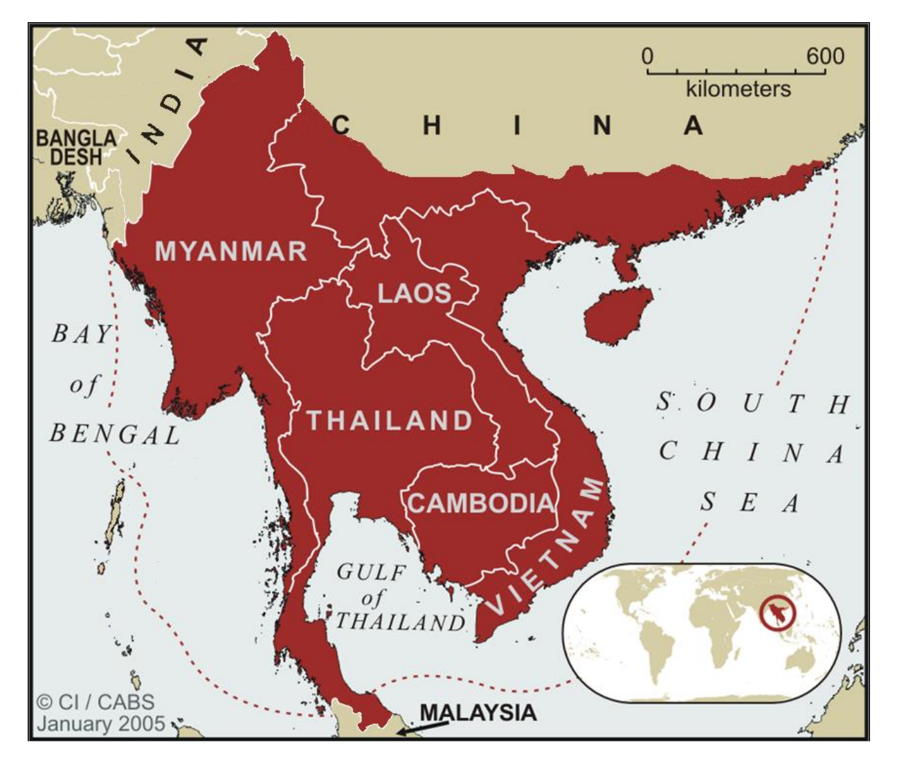
Figure 1. Boundaries of the Indo-Burma Hotspot Followed by CEPF Investment

For the purposes of CEPF investment, the Indo-Burma Hotspot comprises all non-marine parts of Cambodia, Lao PDR, Myanmar, Thailand and Vietnam, plus parts of southern China, including Hong Kong and Macao Special Administrative Regions (Figure 1).