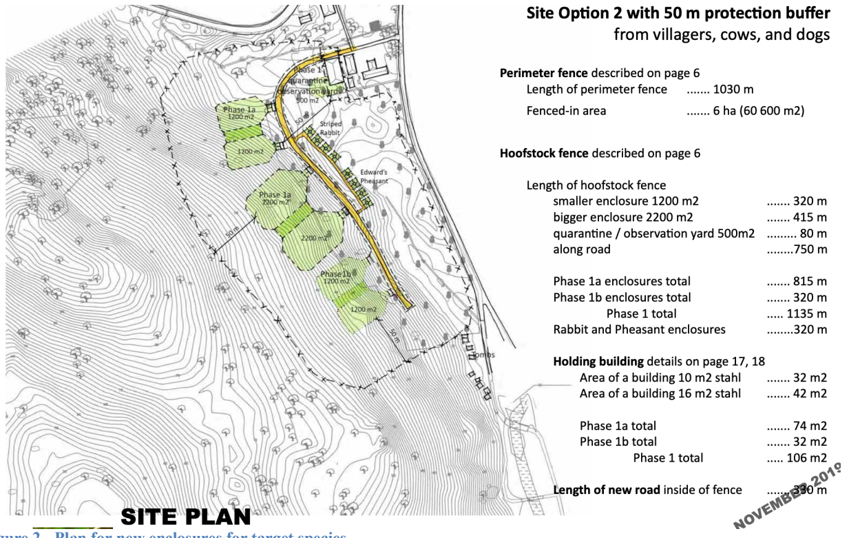
Figure 2 - Plan for new enclosures for target species