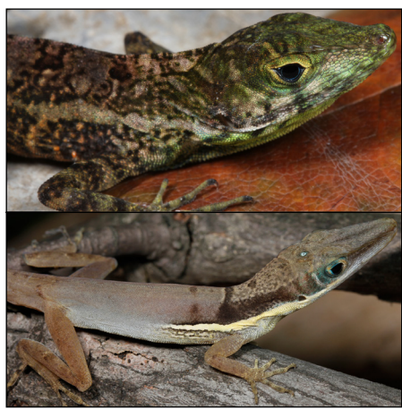
Fig. 6. Threatened lizards, Anolis rupinae (above), A. dolichocephalus (below) [SB Hedges].

Thirty-six species of birds have been observed during these visits to Grand Bois: Anthracothorax dominicus, Buteo jamaicensis, Calyptophilus tertius, Catharthes aura, Chlorostilbon swainsonii, Coccyzus Iongirostris, Coereba flaveola, Contopus hispaniolensis, Dulus dominicus, Eleania fallax, Euphonia musica, Falco sparverius, Icterus dominicensis, Loxigilla violacea, Melanerpes striatus, Mellisuga minima, Myadestes genibarbis, Nesoctites micromegas, Patagioenas squamosa, Phaenicophilus poliocephalus, Priotelus roseigaster, Progene dominicensis, Quiscalus niger, Setophaga caerulescens, S. ruticilla, Spindalis dominicensis, Tachycineta euchrysea, Tiaris bicolor, T. olivacea, Todus angustirostris, T. subulatus, Turdus plumbeus, Tyto alba, Vireo altiloguus, Xenoligea montana and Zenaida macroura. Of those, two endemic Hispaniolan species are