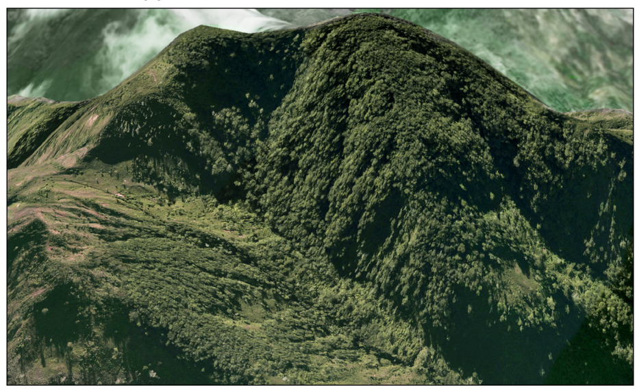
Fig. 2. View of Grand Bois and The Valley from the northwest (high-resolution satellite image overlay in Google Earth).