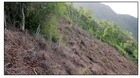
Fig. 8. Deforestation near helipad and spring on East Ridge.

IUCN Vulnerable (VU) status: the Western Chat Tanager (C. tertius) and the White-winged Warbler (X. montana). Two other endemic Hispaniolan birds are Near Threatened (NT) status: the Grey-crowned Palm-tanager (P. poliocephalus) and the Hispaniolan Trogon (P. roseigaster, Fig. 7). The Golden Swallow (T. euchrysea) is an IUCN VU species that is found on only on Hispaniola since it has likely been extirpated on Jamaica. Grand Bois is a new location for these rare birds, which have very little habitat left elsewhere. Only one bat species has been observed so far—the Jamaican Fruit Bat (Artibeus jamaicensis). It is fairly common and plays an important role in seed dispersal of the native tree and shrub species found in Grand Bois.