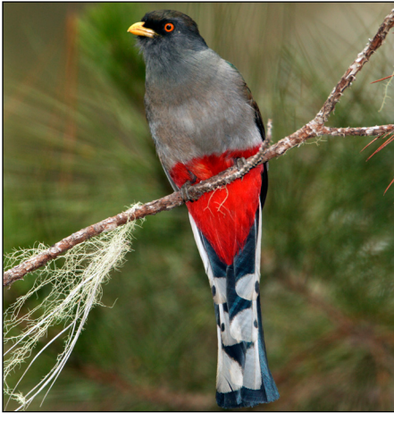
Fig. 7. Endemic bird, Hispaniolan Trogon [E Fernandez].

IUCN Vulnerable (VU) status: the Western Chat Tanager (C. tertius) and the White-winged Warbler (X. montana). Two other endemic Hispaniolan birds are Near Threatened (NT) status: the Grey-crowned Palm-tanager (P. poliocephalus) and the Hispaniolan Trogon (P. roseigaster, Fig. 7). The Golden Swallow (T. euchrysea) is an IUCN VU species that is found on only on Hispaniola since it has likely been extirpated on Jamaica. Grand Bois is a new location for these rare birds, which have very little habitat left elsewhere. Only one bat species has been observed so far—the Jamaican Fruit Bat (Artibeus jamaicensis). It is fairly common and plays an important role in seed dispersal of the native tree and shrub species found in Grand Bois.